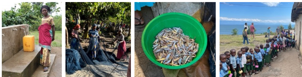
Boneza in 2023