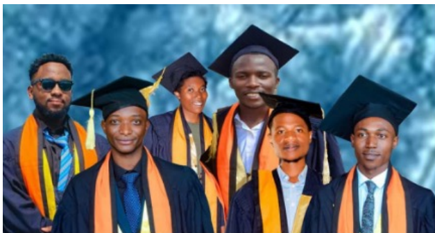
This year these members of the Pioneer class graduated from the university in Kigali.