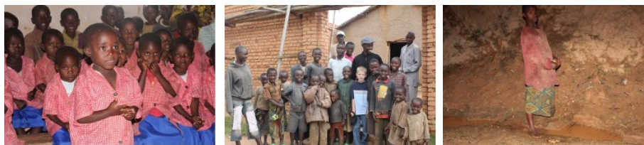
Boneza in 2011