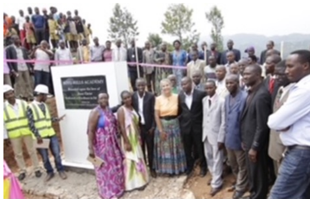
Dedicated of KHA June 2015

When KHA opened in 2015, the Pioneer class of 21 students were on the brink of life changing opportunities. Their hard work through the first years of KHA gave them a true bond and hope for the future. Graduates have gone on to university in Kigali and have also remained in Boneza to start their own businesses, build with ARM, and help their families.