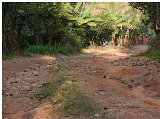
The old road